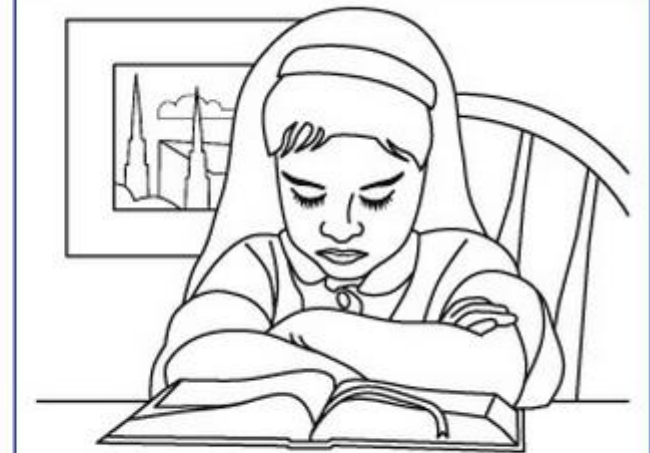
Pray when reading the scriptures.