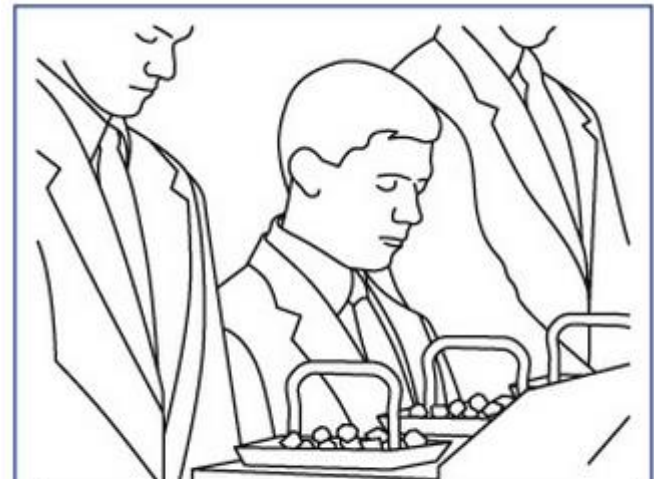
The Sacrament Prayer.