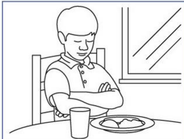
Blessing on the food.