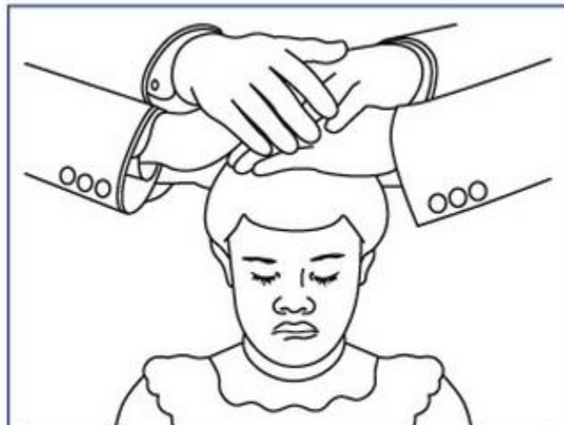
Blessings are prayers.