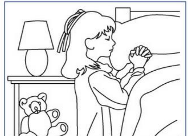
Pray before going to bed.