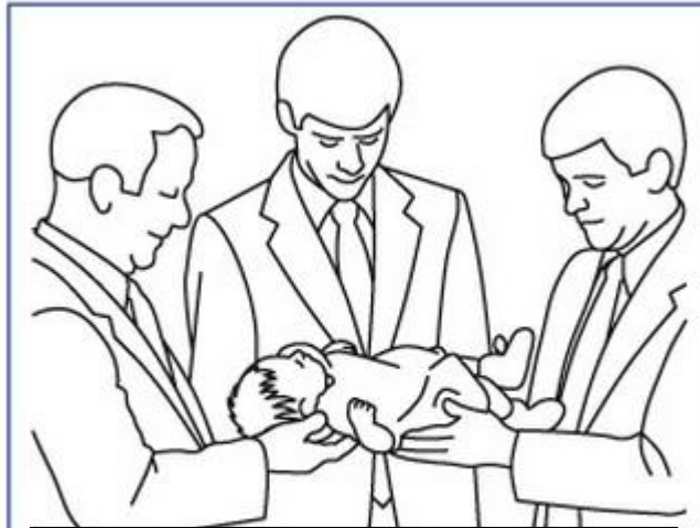
Baby blessings are prayers.